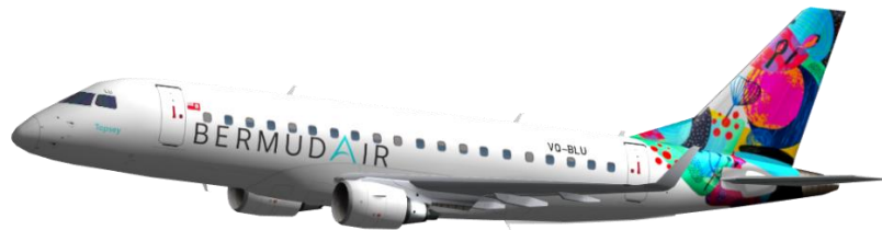
Bermudair Embraer E-175 aircraft.

Flights are expected to be operated on Embraer 175 twin-engine jets, which offer 70 coach and business seats in a 2/2 configuration with no middle seats. The Embraer E175 aircraft, renowned for its exceptional performance and passenger comfort, offers a perfect blend of sophistication and functionality, providing a superior travel experience to passengers. BermudAir will also soon integrate two new, larger Embraer E190 aircraft , providing seating for 96 coach and business seats in a 2/2 configuration. In addition, travelers can enjoy BermudAir's signature in-flight service, with complimentary Bermuda-sourced beverages and snacks available to all guests.