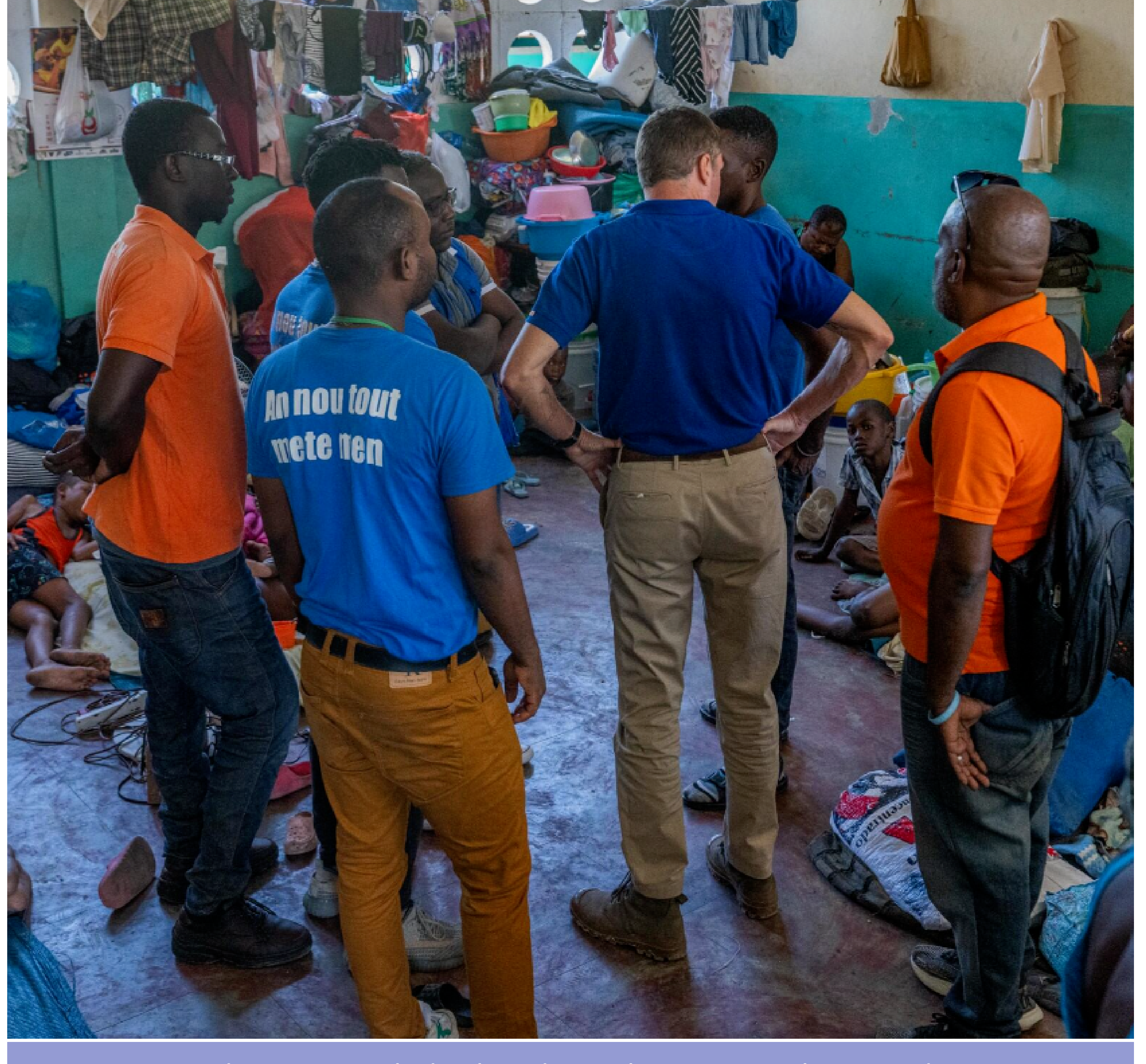
An IOM team discusses with displaced people to assess their needs.